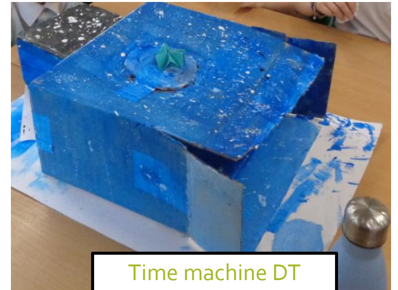
Time machine DT