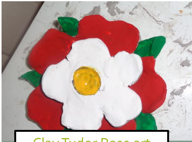
Clay Tudor Rose art