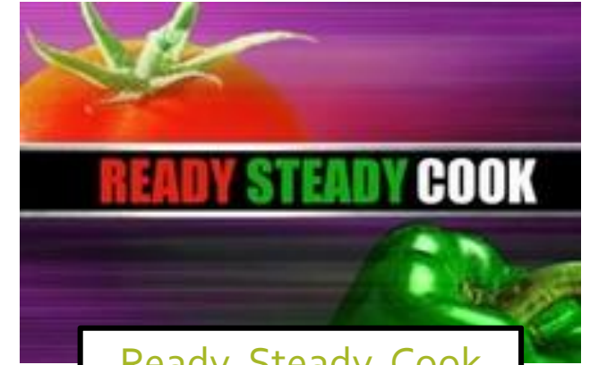
Ready, Steady, Cook